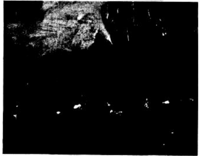
Marek's disease. Tumors on the liver and other visceral organs are often noted. Leg and wing nerves may be swollen.

Caused by a herpesvirus, the disease is often characterized by abnormal cell growth in the peripheral nerves and central nervous system. Hence, the common name for one form of Marek's: fowl paralysis. In addition to the nerves, however, the disease also may cause lesions on visceral organs and other tissues, including the eyes and the feather follicles. The most prominent lesions may be tumors on the liver, kidneys, testes, ova, spleen, and lungs. In such cases, nerve swelling may not be involved.